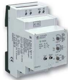
Insulation monitor RN 5897/300